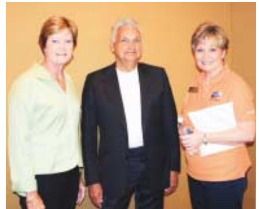
University of Tennessee Head Women's Basketball Coach, Pat Head Summitt (on left) was guest speaker at the Regional Campaign Kick-off in Kingsport.

Baileyton Community Chest Blountville Community Chest Fall Branch Community Chest Gray Community Chest Greater Indian Springs Community Chest Greater West Carters Valley Community Chest Mount Carmel Community Chest Piney Flats Community Chest, Inc. Sullivan South Area Community Chest Sulphur Springs Community Chest United Fund of Bluff City United Way of Bristol TN-VA Inc. United Way of Elizabethton-Carter County United Way of Greene County United Way of Hawkins County, Inc. United Way of Mountain City/Johnson County United Way of Russell and Washington Counties, VA United Way of Southwest Virginia, Inc. United Way of Unicoi County United Way of Washington County, TN, Inc.