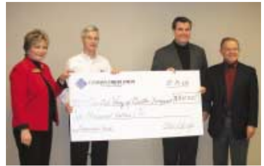
Eastman Credit Union makes a gift to UWGK's endowment in honor of the 75th Anniversary of both organizations.