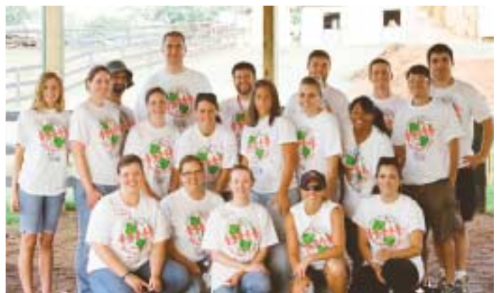
The Young Leaders Society provides talent for the future of United Way.

Anyone who is interested in learning more about Young Leaders may visit the United Way website at www.uwaykpt.org or the group's Facebook page, United Way of Greater Kingsport Young Leaders Society.